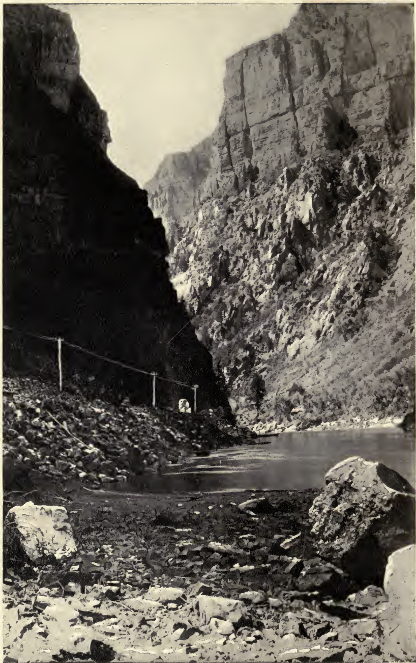
CANON OF THE GRAND RIVER NEAR GLENWOOD SPRINGS SHOWING TUNNEL